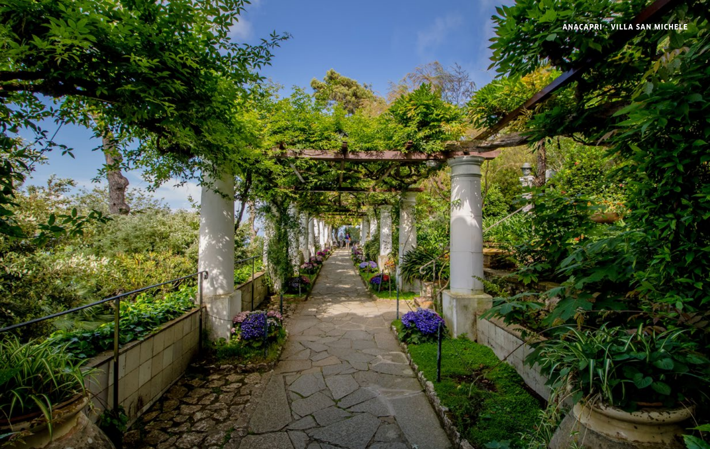
ANACAPRI - VILLA SAN MICHELE